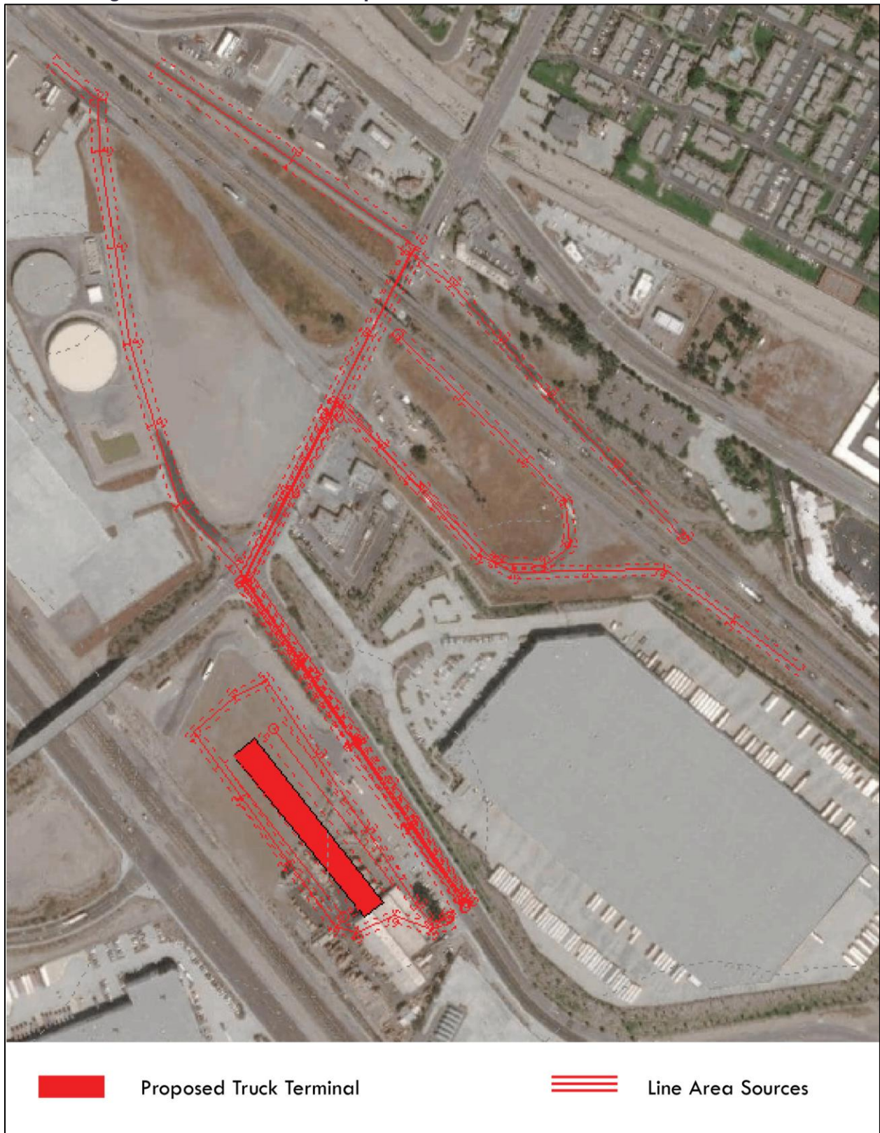
Figure 3: Locations of the Project Onsite and Offsite DPM Emission Sources